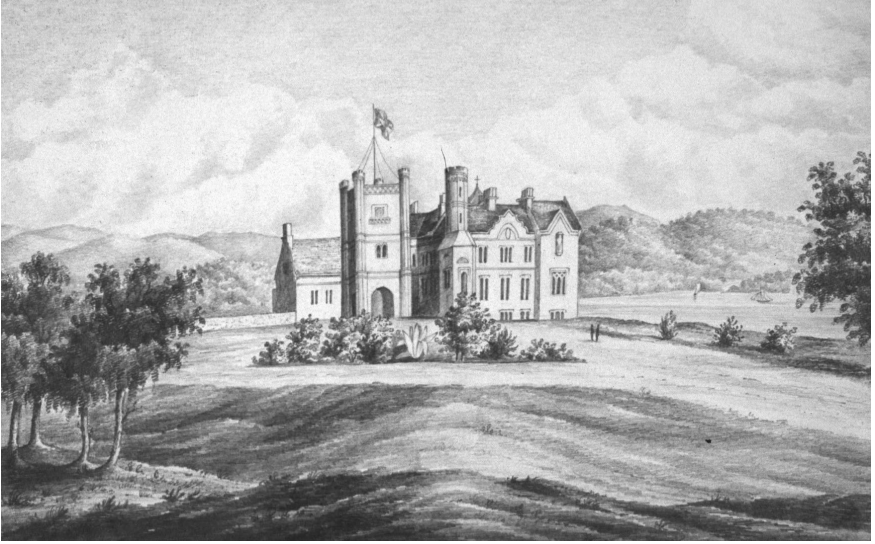
28. (New) Government House, by Emily Stuart Bowring, 1858

immense height and size; ... amongst all, there appeared the bright green of an English walnut tree, loaded, like every thing else, with fruit, and some very healthy-looking young oaks. Altogether, it would be thought a delightful garden anywhere; and to us, just come off a long sea voyage, it seemed little short of Paradise!